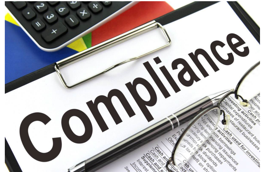
Image is used under Creative Commons 3 – CC BY-SA 3.0. Image by Nick Youngson http://www.nyphotographic.com